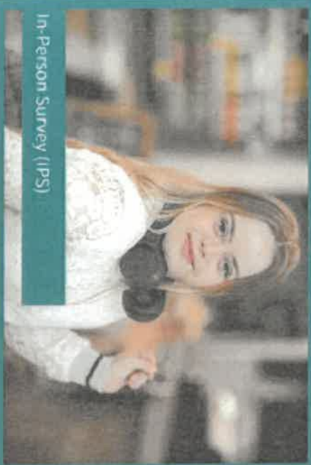
In-Person Survey (IPS)