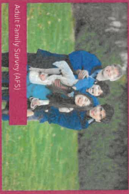
Adult Family Survey (AFS)