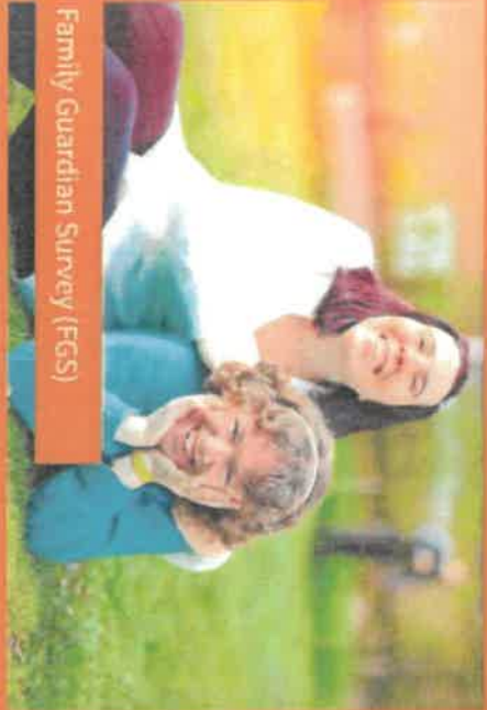
Family Guardian Survey (FGS)