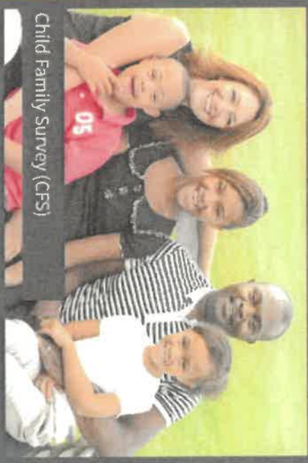
Child Family Survey (CFS)